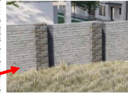
TAPERING MASONRY WALL | 6 FT Rear Yard | 4 FT Front Yard